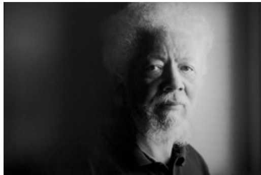
Painter and printmaker Benny Andrews